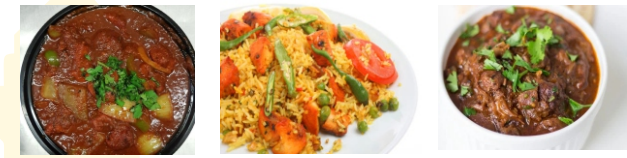
LAMB TIKKA MASALA