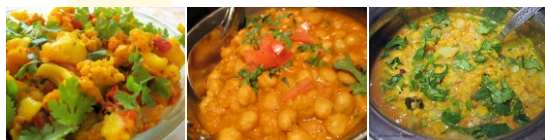
ALOO GOBI CHANA MASALA TARKA DAAL