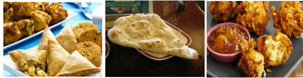
SAMOSAS & PAKORAS